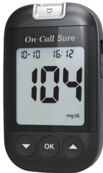
On Call Sure

Blood Glucose Monitoring Systems that have been chosen by millions of patients and healthcare providers around the globe.