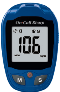
On Call Sharp