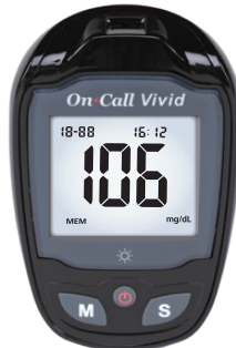
On Call Vivid