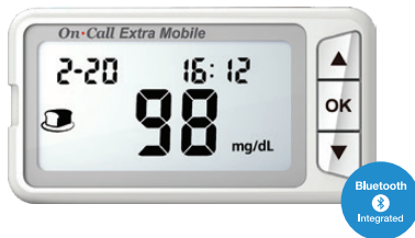
On Call Extra Mobile