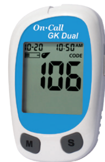
On Call GK Dual