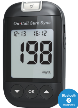
On Call Sure Sync