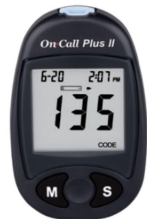
On Call Plus II