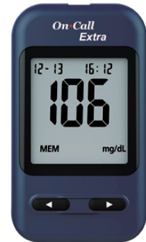
On Call Extra