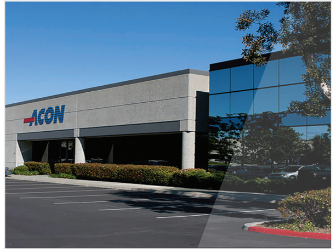
San Diego, California USA